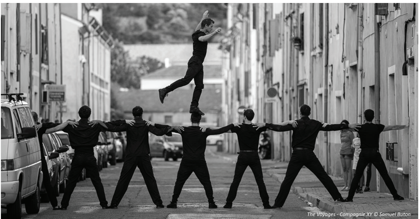
The Voyages - Compagnie XY