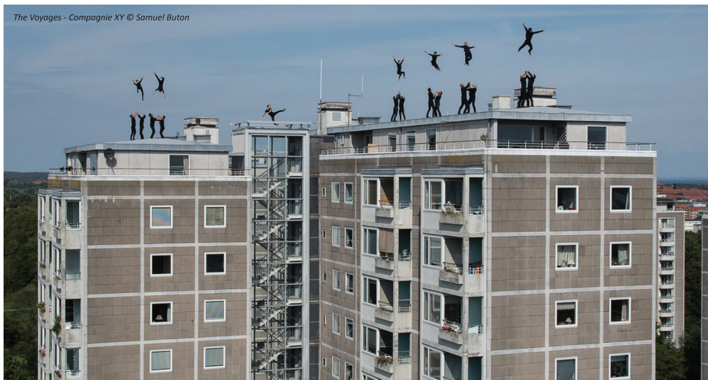
The Voyages - Compagnie XY